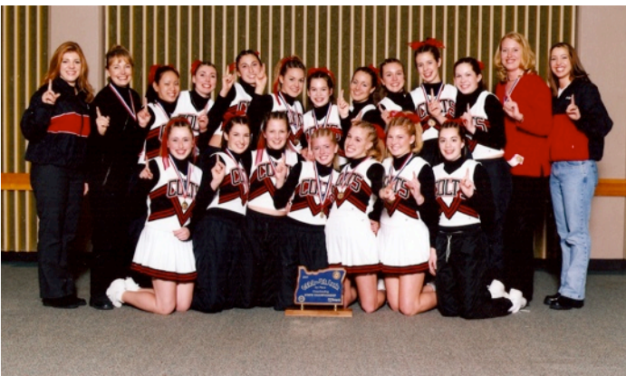
2001 State Championship Team that would go on to win three consecutive state titles